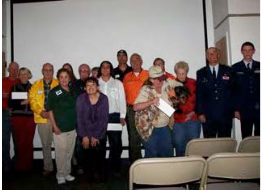
Group picture of all of the happy gift recipients!